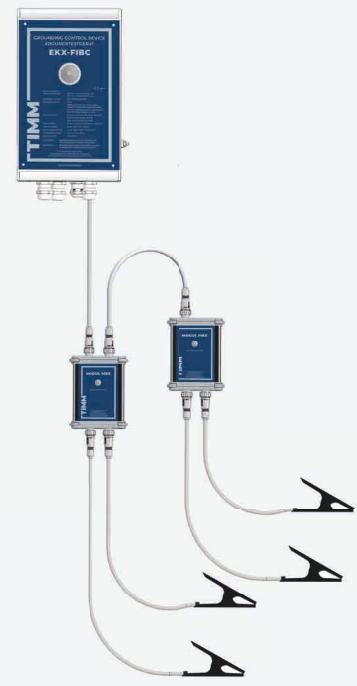
Simultaneous monitoring of 2 big bags

For further information and additional accessories, visit us at www.timm-technology.de/en/products/ekx-fibc or contact us.