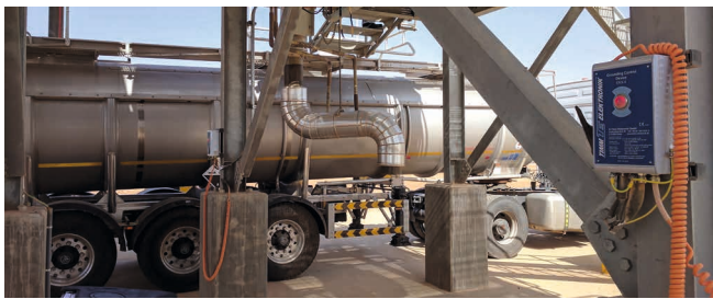
Figure 2: Grounding Control Device EKK-4 for silo trains, railway wagons, tank trucks, barrels and containers

All Grounding Control Devices from TIMM implement our Intelligent Explosion Protection Concept (IEPC), offering the highest level of safety and user-friendliness. The types of protection “increased safety“ and “intrinsic safety“ make the devices easy to install and configure at the loading platform. Reliable detection of the object to be grounded avoids misuse by the operator and forces the grounding clamp to be clamped before each filling / emptying.