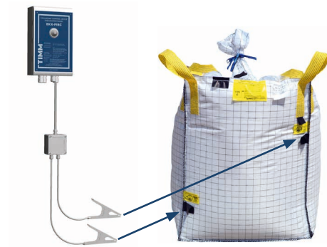
Figure 3: Grounding Control Device EKK-FIBC for Big Bags / FIBC type C

The TIMM Grounding Control Devices are all state-of-the-art and approved for use in hazardous areas of zone 21 and 22 in accordance with ATEX directive 2014/34 /EU. Only grounding systems that implement the state of the art can fully meet best practice requirements and make a decisive contribution to the safety of handling bulk materials.