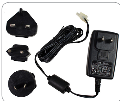
AC Adaptor Kit 14-21244 includes interchangeable US, UK, Continental Europe and China electrical connectors.

1. Tested in accordance with ANSI/ESD STM3.1-2006.